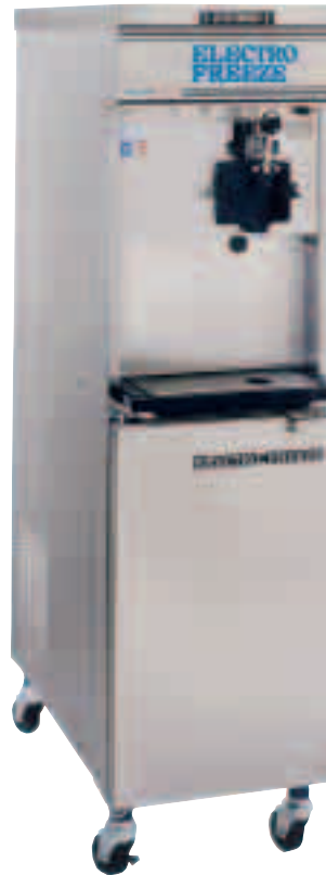
Model 44RMT 15RMT

The mix level indicator features a flashing light to alert the operator when mix is needed.